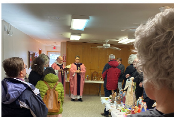
On December 17, 2023, the Secular Franciscans at Mary Immaculate parish in Kirksville, Missouri, hosted a celebration of the 800th anniversary of the very first manger scene.