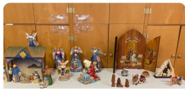
Parishioners shared a wide variety of creches from as far away as Italy, Central America, and Burma.