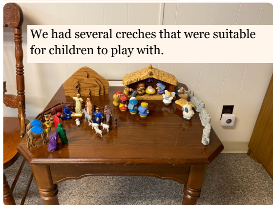
We had several creches that were suitable for children to play with.