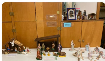
The Chapel of the Crèche, built at the cave where St. Francis enacted the first nativity scene, with live animals.